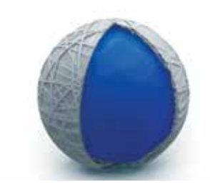
Contains the two most active isomers of the eight in cypermethrin.