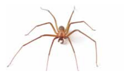
Cellar (top), black widow (middle), and brown recluse (bottom)